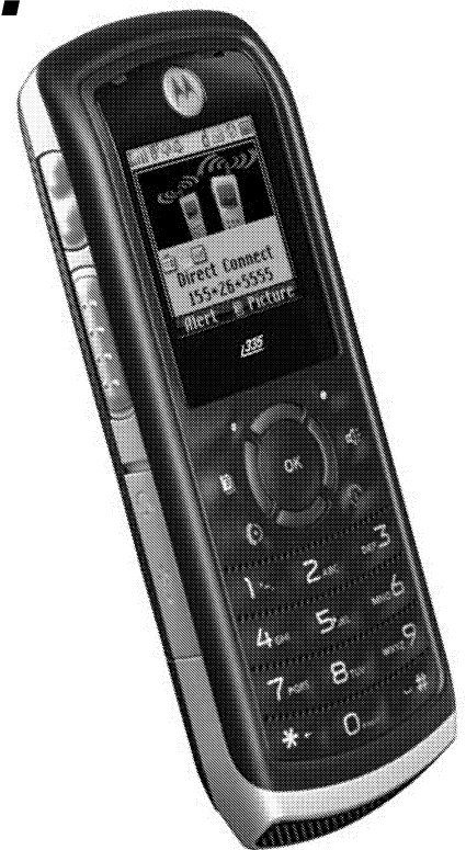
i335 by Motorola

Visit sprint.com/upgrades to see how much you can save on your next new phone.