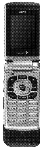
Hard-working and good-looking The PRO-200 by Sanyo® Stylish, slim design